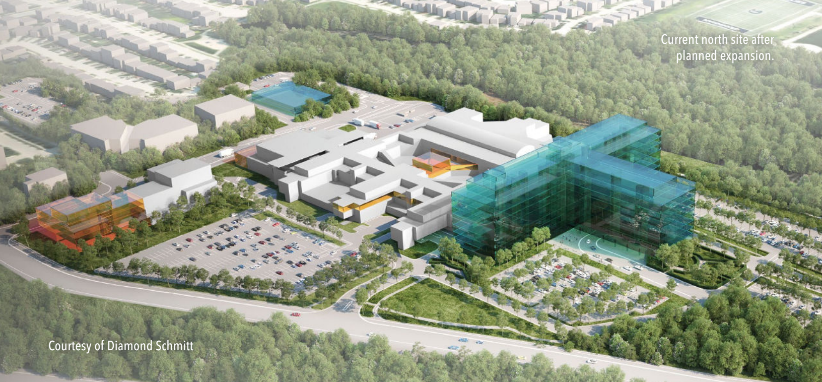
Current north site after planned expansion.